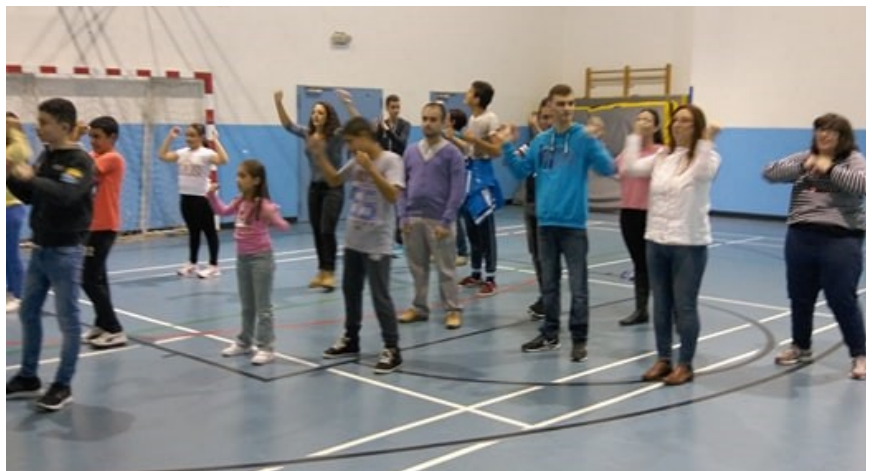
Preparation for talent show