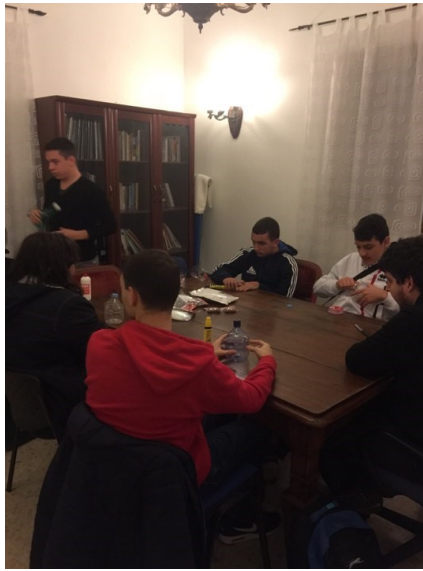
Christmas activities and crafts