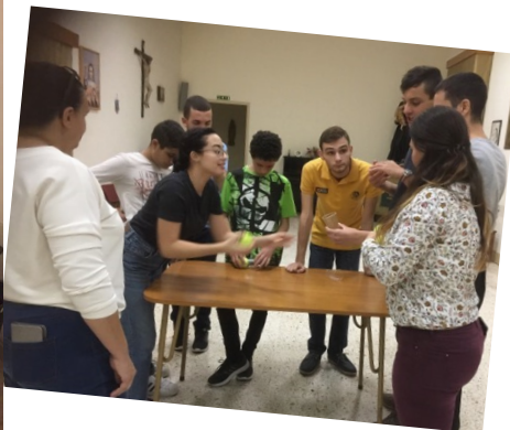
Getting to Know each other games