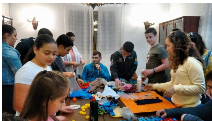
European Waste Reduction Competition