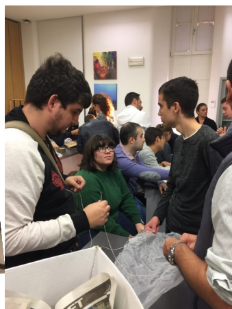
Visit at Esplora