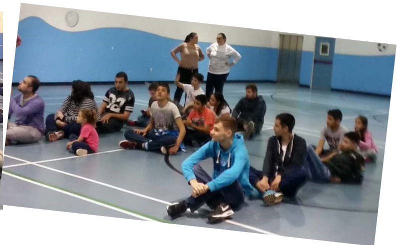
Sports activity at the gymnasium of the St Jeanne Antide College in Tarxien